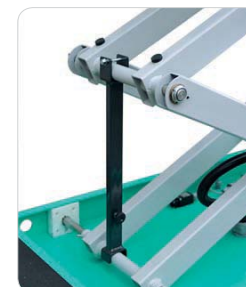
Safety beam, for use, during maintenance