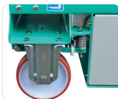
Auto braking on castors