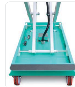
Functional chassis design for easy cleaning