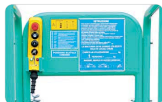
Removable control allows for easy and safe movement Equipped with key switch and emergency stop button