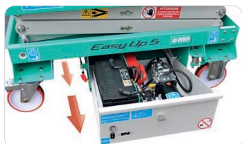
All the component parts are easily accessible for servicing